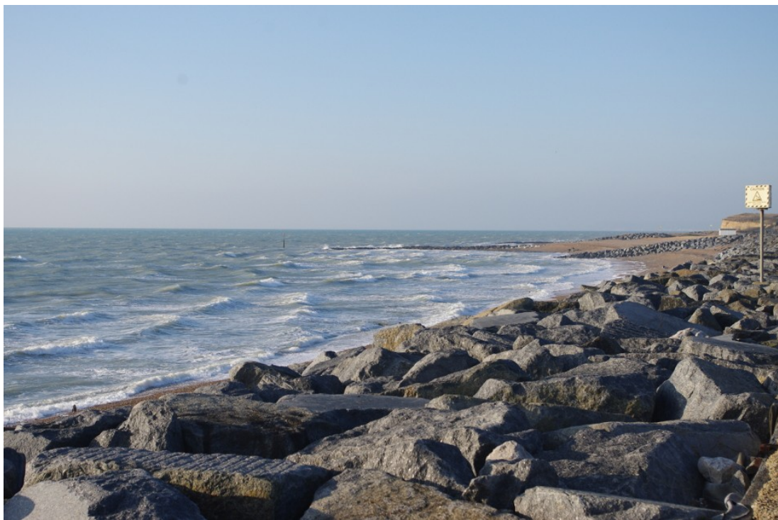
Along the coastal strip