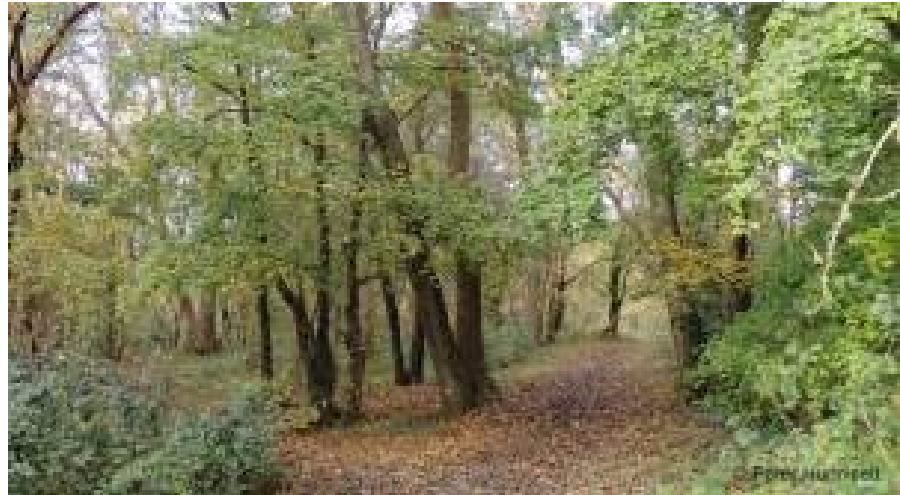
Filsham Reed Bed