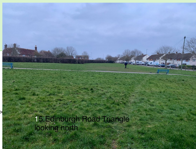
15. Edinburgh Road Triangle looking north