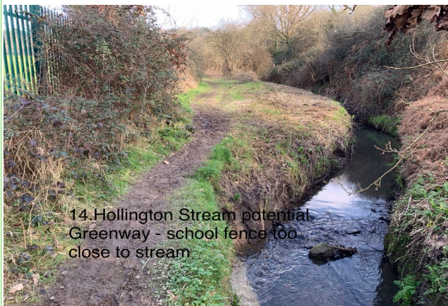
14. Hollington Stream potential Greenway - school fence too close to stream