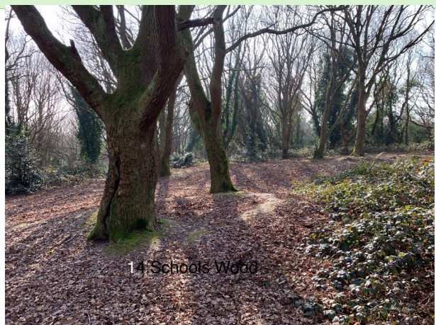
14 Schools Wood