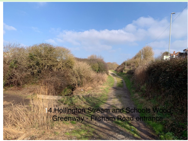
14. Hollington Stream and Schools Wood Greenway - Filsham Road entrance