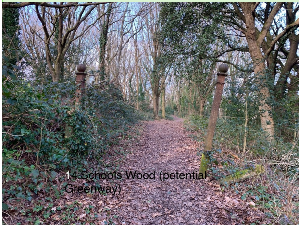
14 Schools Wood (potential Greenway)