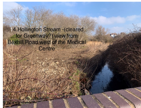
14. Hollington Stream - (cleared for Greenway?) view from Bexhill Road west of the Medical Centre