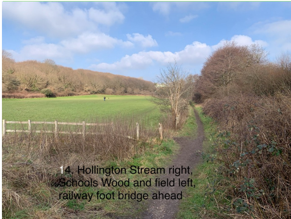
14. Hollington Stream right, Schools Wood and field left, railway foot bridge ahead