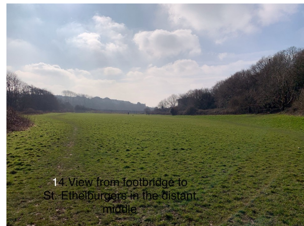
14 View from footbridge to St. Ethelburgers in the distant middle