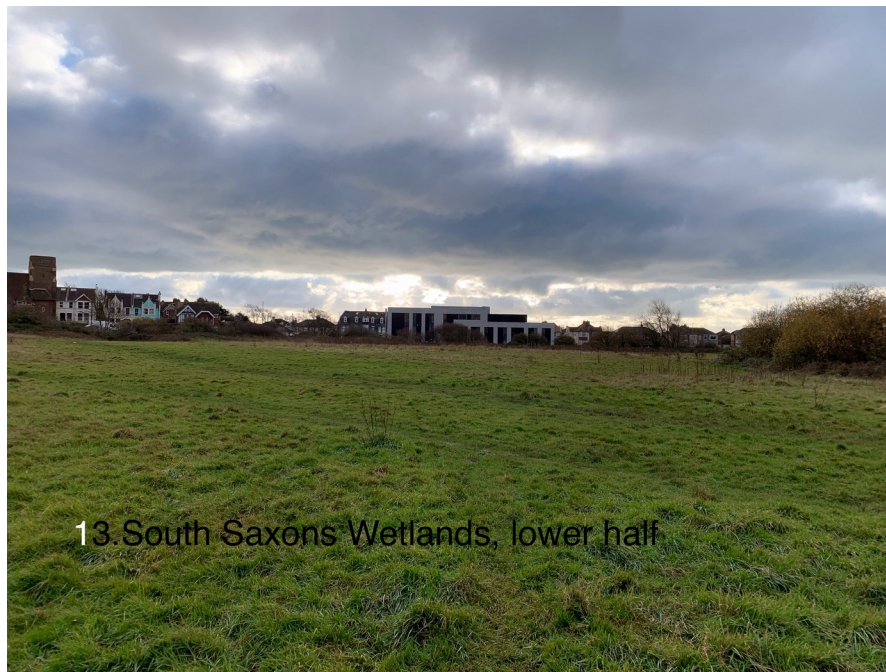
South Saxon Wetlands Lower half

Aerial photo map or plan showing accurate boundary of site.