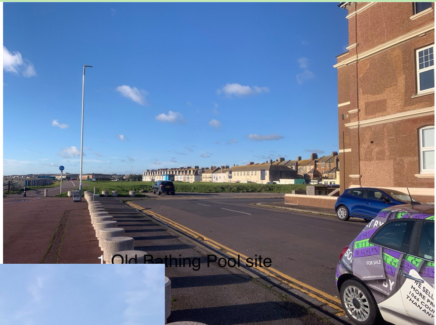
View of the site from the East