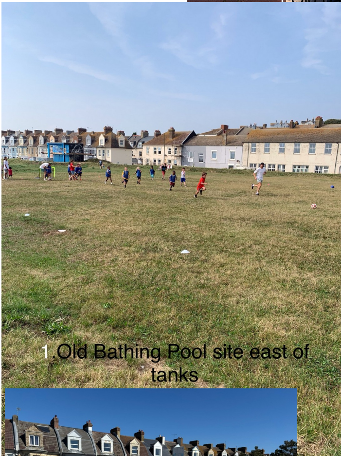
Old Bathing Pool site east of the under ground tanks