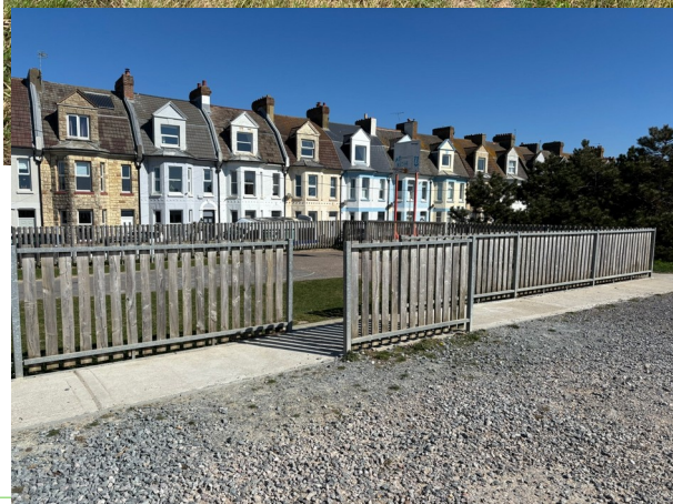
Entrance to the play area